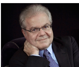
EMANUEL AX piano

B orn in modern day Lvov, Poland, Emanuel