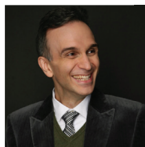
GIL SHAHAM violin

Gil Shaham’s flawless technique, combined with his inimitable warmth and generosity of spirit, has solidified his renown as an American master. The GRAMMY® winner is sought after worldwide for concerto appearances with leading orchestras and conductors, and he regularly gives recitals and appears with ensembles on the world’s great concert stages and at the most prestigious festivals.