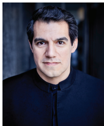
MIGUEL HARTH-BEDOYA conductor

P eruvian conductor Miguel Harth-Bedoya is a master of color, drawing idiomatic interpretations from