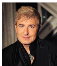
JEAN-YVES THIBAUDET piano

F or more than three decades, Jean-Yves Thibaudet has performed worldwide, recorded more than 50 albums and built a reputation as one of today's finest pianists. He plays a range of solo, chamber and orchestral repertoire