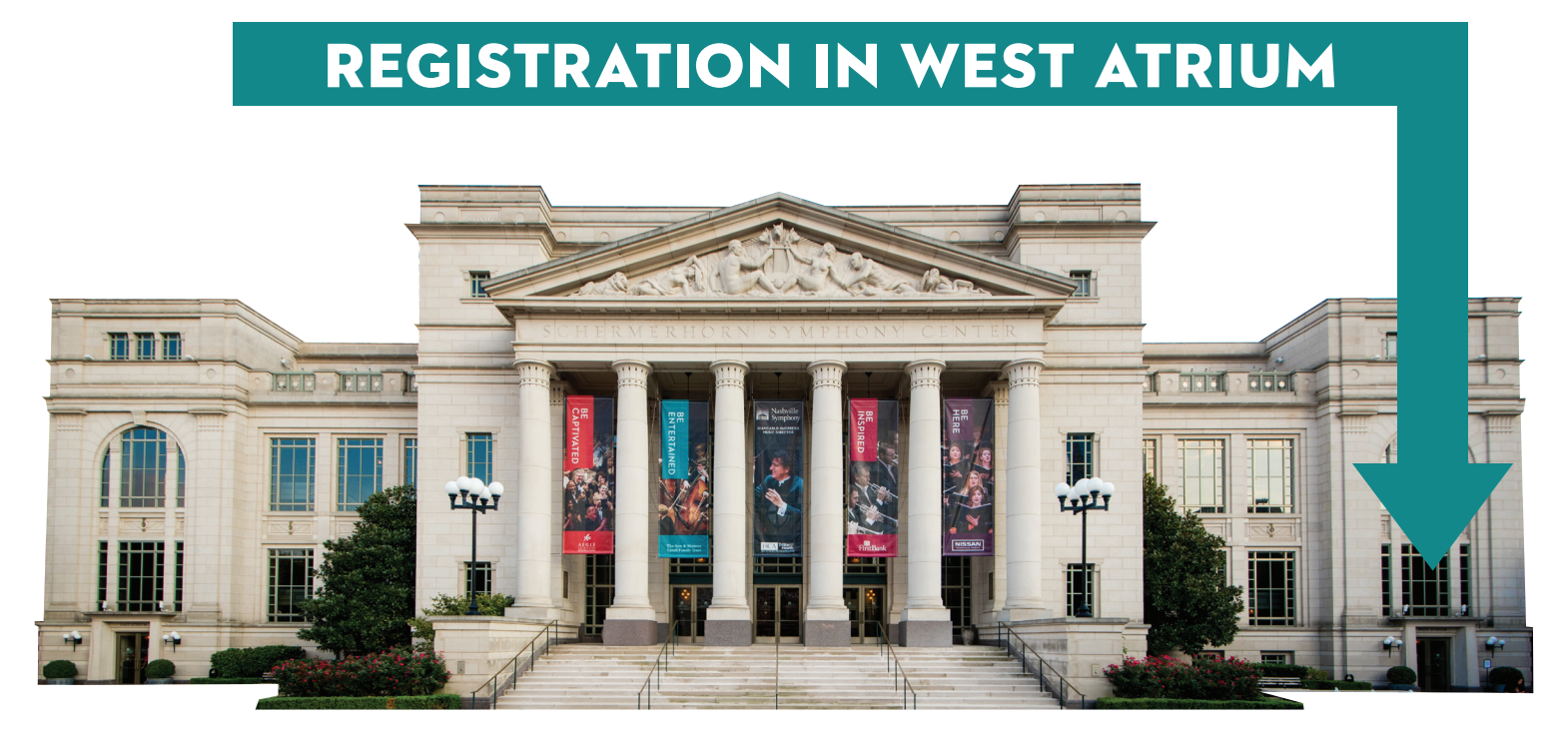
Home school groups and families enter through the WEST ATRIUM DOOR to sign in.

We may park our car in a lot near the Schermerhorn.