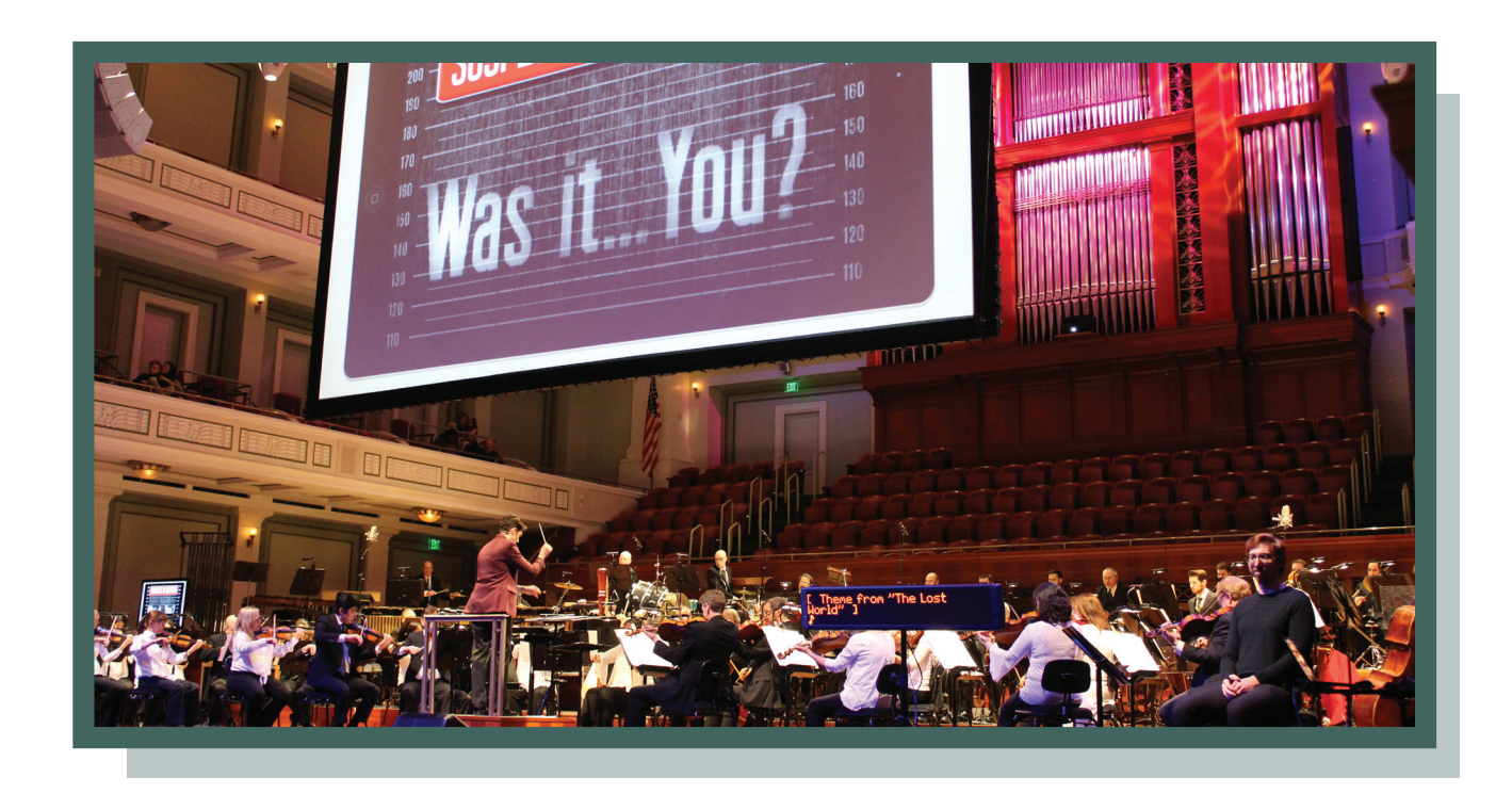
There might be pictures or video as well.

The conductor or a guest might talk to us about the music.