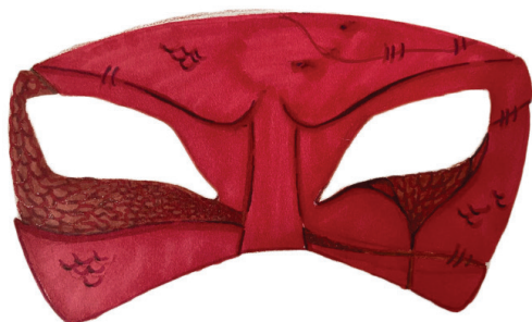
Mask illustration courtesy of Eternal Lokumbe

the projections, film and animations also encompass “magical places that are not part of reality, including dream worlds and the world in between the real world and the heavens, where the ancestors are beholding the others.” After intermission, an ascending platform is added to the ship design and becomes the symbolic space for the opera’s spiritual journey. This allows for a shift in focus to the triumph and healing of the Jonah People.